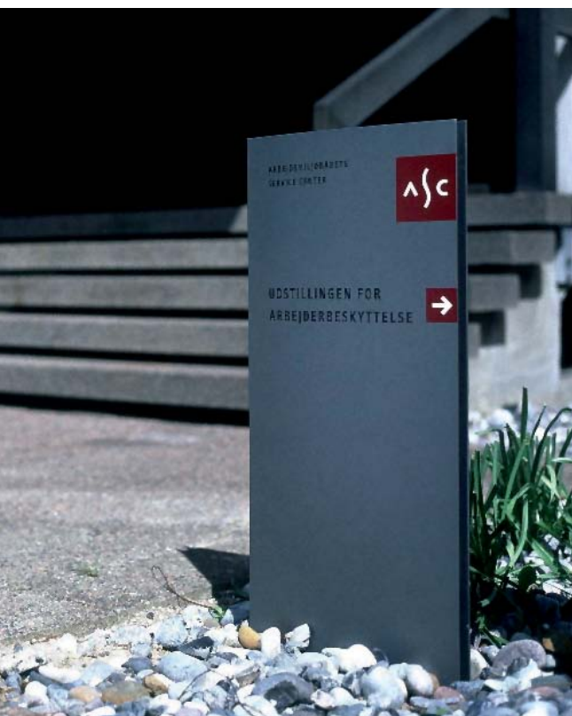
Mini CurveSign monolith in lacquered aluminum.

Monoliths are made of aluminium, steel and glass and designed to harmonise with existing signage and the building as a whole.