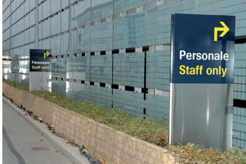
Staff parking monoliths at Copenhagen Airport. Material: Stainless steel. Text and arrow feature milled front, which shine in the dark.