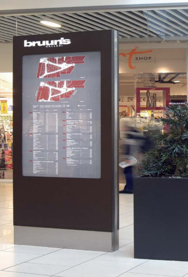
Inner lit wayfinder monolith with changable overview plan.